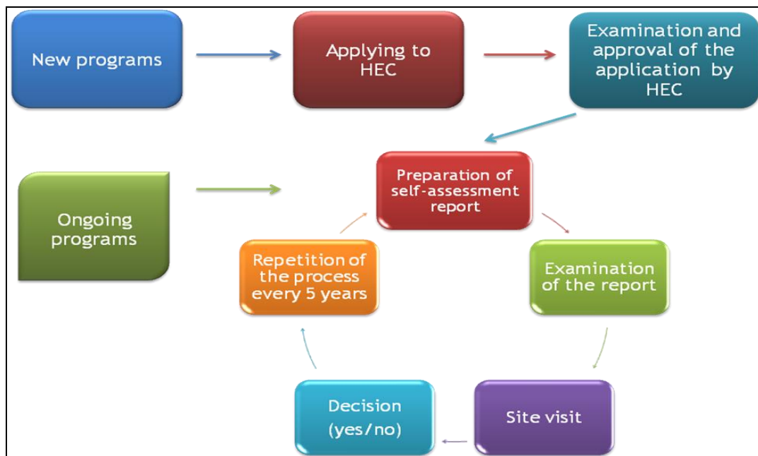
Figure: 1 Proposed Accreditation Framework for ODL Programs

Duration of a re-accreditation process may change according to the higher education institution's self-assessment report preparation time; however the whole process is estimated to be completed at least in 3 months. The proposed framework for the accreditation of new and ongoing ODL programs is shown in Figure 1.