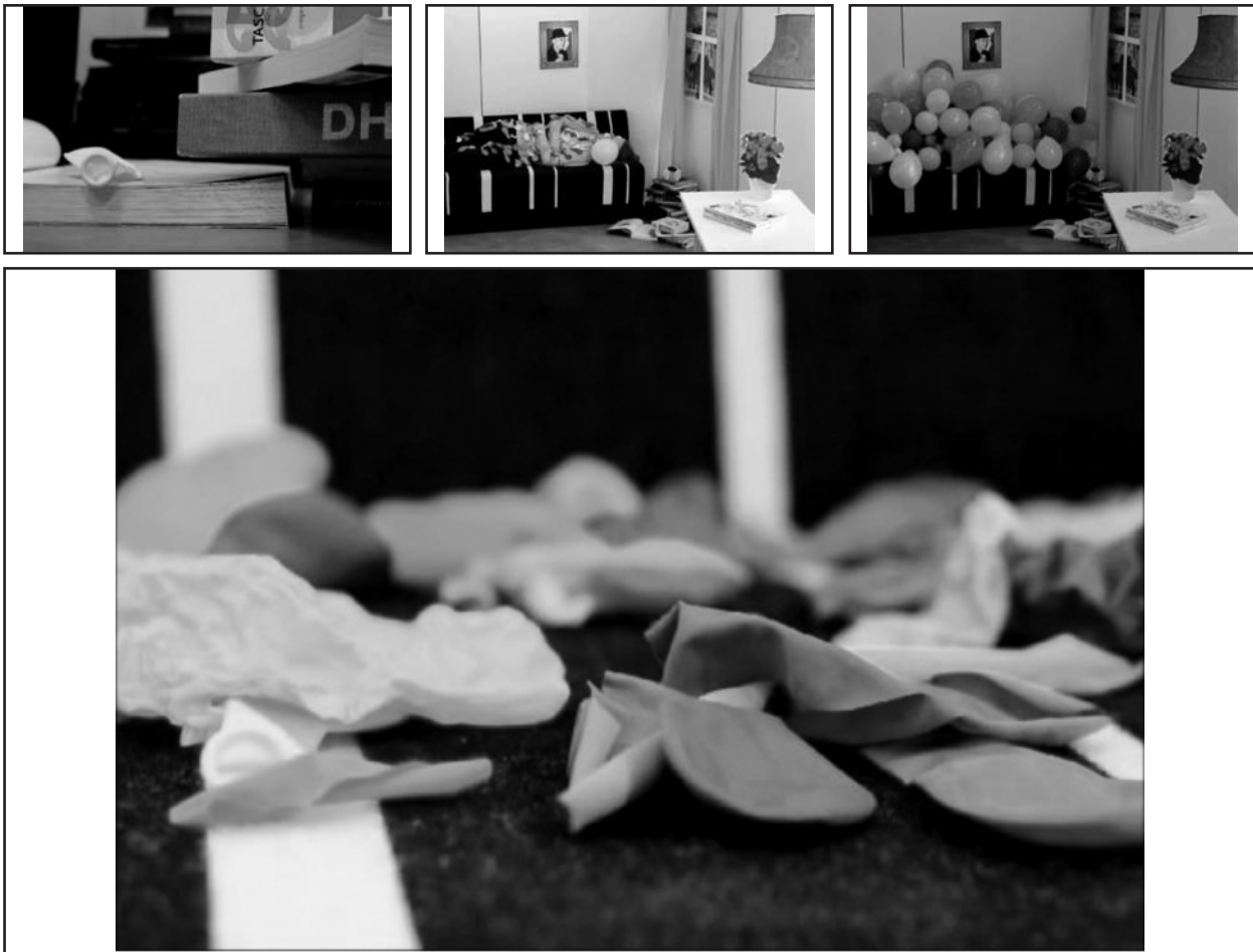
Figure 3. Four frames from another animation produced during the course, entitled 'Power Nap'

One of the groups had the initial idea that they would leave the provided default setup altogether and just use the camera on one of their smartphones to record the entire animation. After some time experimenting with this, they returned to the setup. When asked why, they provided slightly diverse answers but one of them involved the problem of lacking live preview – i.e. in real time being able to see what the camera sees from the same software that is used to capture the frames.