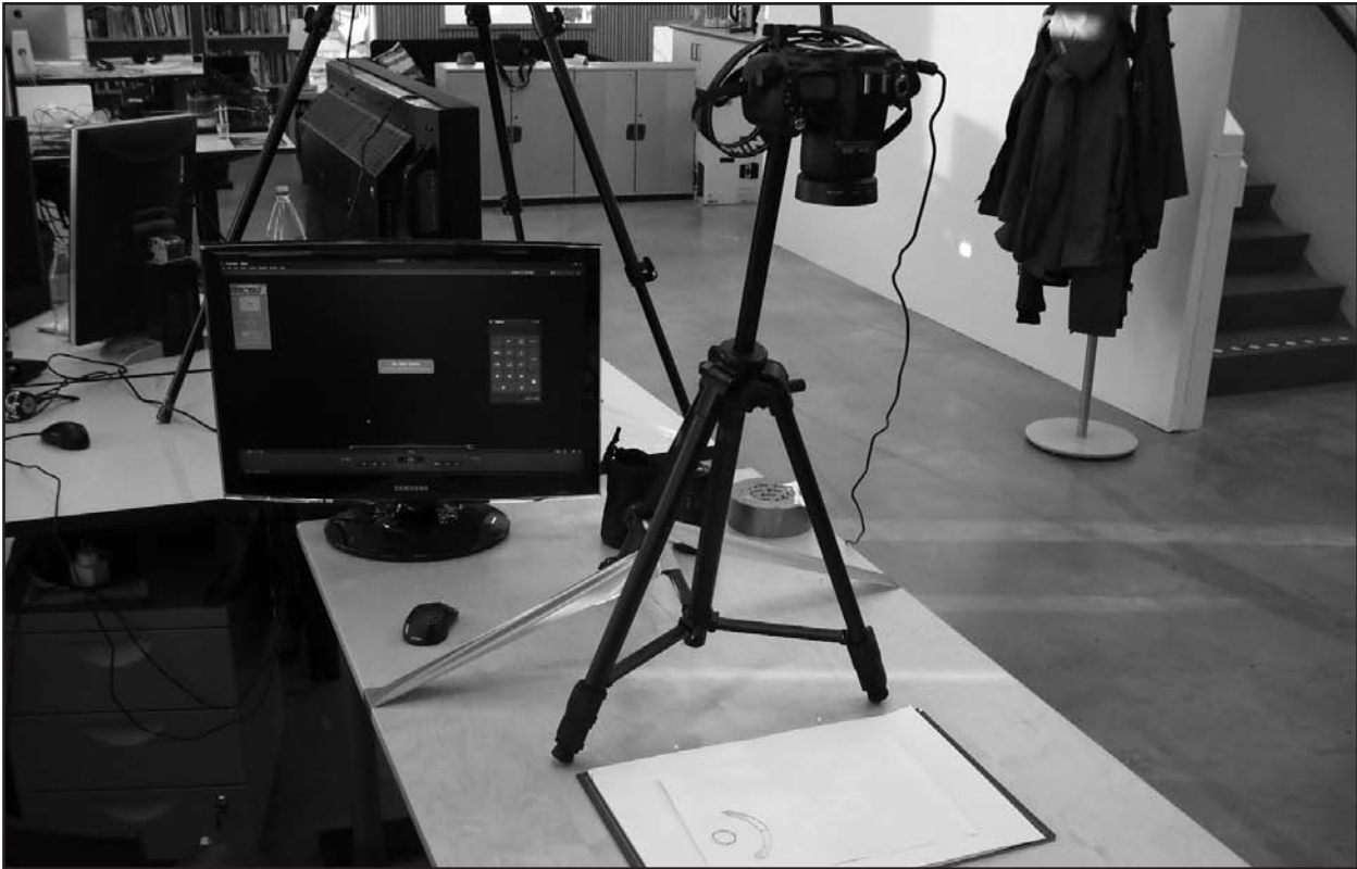
Figure 1. An example of a typical stop motion animation setup

decided on a rather open theme (around the concept of 'growth') and a maximum total running time of one minute for their animations. The intention behind these choices was to provide both guidance and restrictions to the students while still remaining as open as possible to allow for their creativity to flourish.