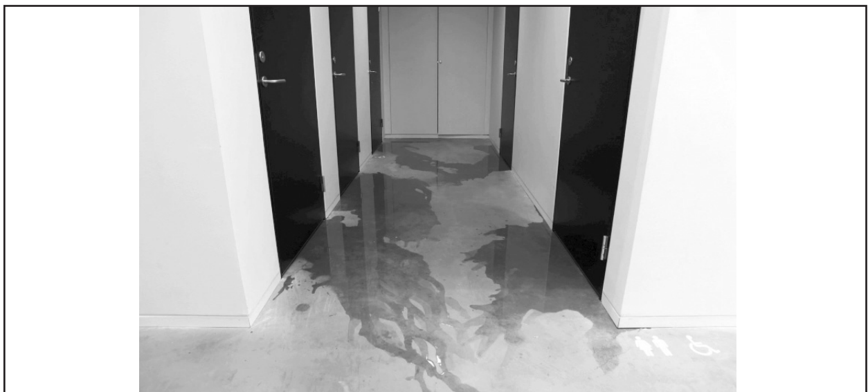
Figure 5. A single frame from an animation produced during the course (untitled), where the students used stop motion to allow water to defy gravity

As a general conclusion, most students were surprised how much work actually goes into producing a minute-long stop motion animation. Although stop motion sequences may look trivial, they still require substantial investment in time, involvement, and engagement. However, what you dedicate in time is balanced by the rather unrestricted creativity of the medium (Fallman & Moussette, 2011). The animations produced were very varied and presented ideas that would have taken weeks or months to realise in another way, i.e. through CAD or 3D animation software, using some special effects