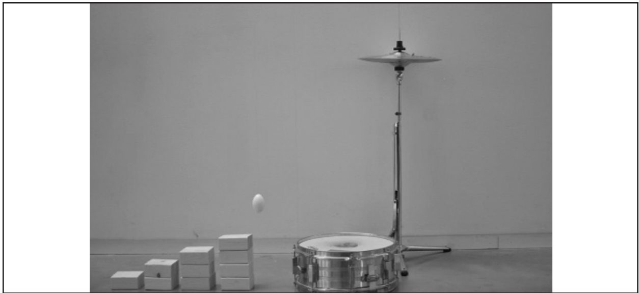
Figure 4. A single frame from an animation produced during the course, entitled 'Eggzit'

Another tendency we saw with the architecture students that we have not experienced previously with interaction design students was that a few groups tended to take the examples we showed during the introduction on day 1 rather literally, i.e. 'reusing' ideas rather bluntly without much tweaking. It is difficult to draw any general conclusions from this, obviously, but we may speculate – partly informed by discussing it with the group – that a reason might be a combination of lack of familiarity with the hardware and software setups and the lack of time to invent an entirely new concept.