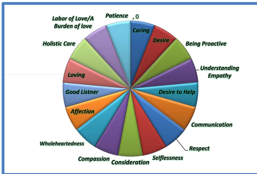
Figure 2. Seventeen Attributes of Caregiving

As one caregiver eloquently said, the desire is to "want to be the best I can be," a desire to "give back." The caregiver is understanding of the care recipient's situation and must try not to "bring yourself to the same level." "It is understanding what the care recipient's needs are as best you can." Similarly, another caregiver conveyed the importance of setting aside the fact that one is caring for a loved one and do what needs to be done.