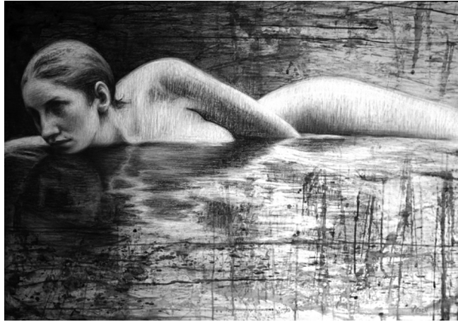
Undertow by Diane Rosen.

comes from Latin cadens , a participle of cadere meaning to fall and leads to our own cadence, meaning the flow of rhythm in verse or music. Inspired by these vivid linguistic roots, and after much experimenting and reworking, I happened upon the idea of merging falling (upside down) figures with falling dice. Only by maintaining the sense of play in this process—like continual throws of the dice and responses to their unforeseeable results—can we engender the kind of random, fortuitous connections that defy reason alone.