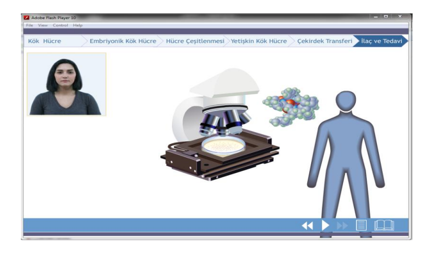
Figure: 1 Headshot of a Real Person