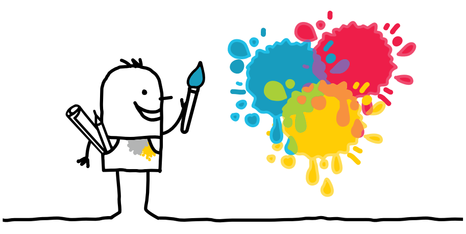
Web tools address many facets of student motivation by empowering them, giving them choice, allowing them to express themselves in their preferred formats, encouraging them to collaborate, and engaging them with interactivity rather than passive consumption.

ToonDoo allows students to select a layout from a menu of templates and upload images or select them from the site's gallery. They can add text and then publish their comics on the site to share and discuss them with their peers.