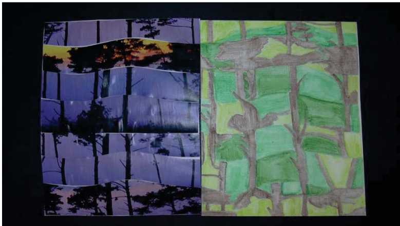
Figure 2. Mary Collage