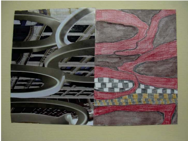
Figure 4. Art Education Student Teacher Collage One

Images, buildings a new city isolation in culture I feel very small Touching Images Ceramic bowls, plates, pitchers