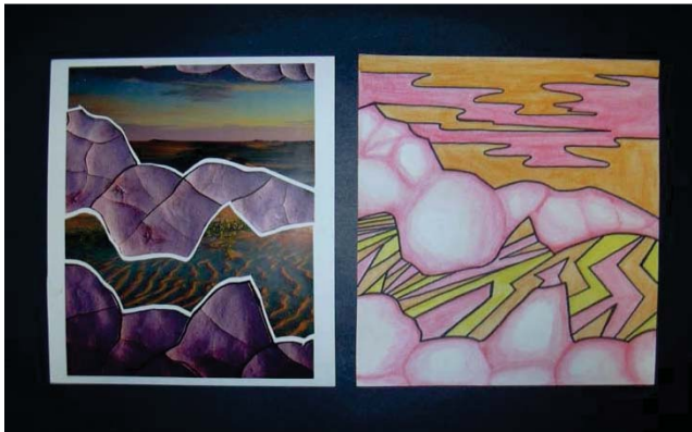
Figure 5. Art Education Student Collage Two

Isolation and touching similar in terms of subject matter Different perspective and meaning