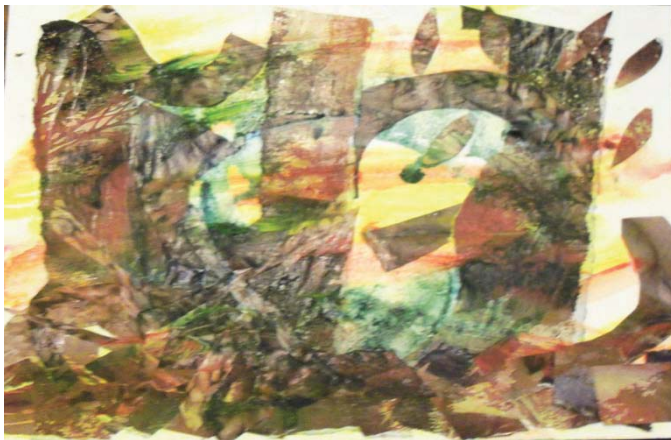
Figure 3. Sarah Collage

Answers disrupted in the messiness of being (im)perfect human teacher We yearn for straight answers drawing lines that become jagged in our grasping