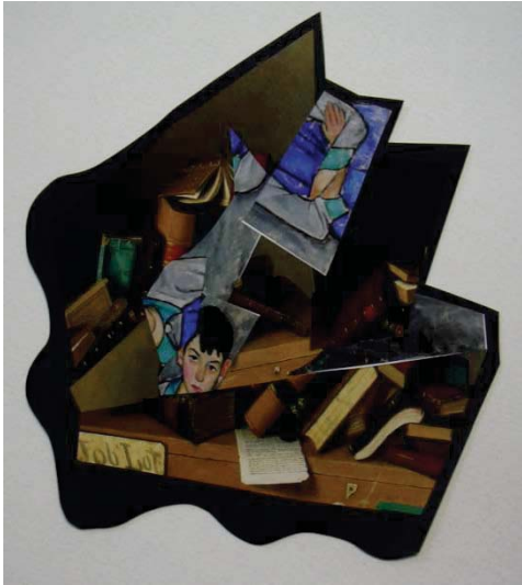
Figure 6. Elementary Education Student Collage One

Touching taught practice into theory through the lives of students people don't understand normalcy sleep in isolation mentored by my teacher family boyfriend alone