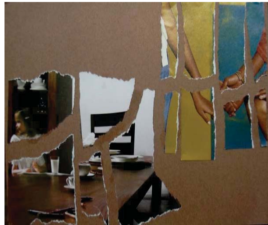
Figure 7. Elementary Education Student Collage Two

precious time in isolation waiting for a call from my love away I am randomly eating time with students teachers touching I find myself accepted