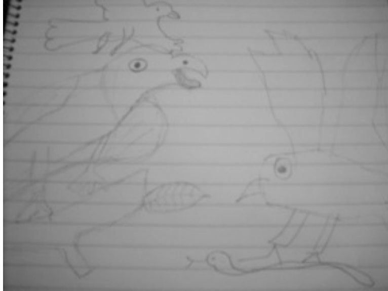
Figure 5. David the storyteller illustrates a point he is making in his journal (Pierce, 2009)

At Site B, RS, never became one with the group, her language proficiency necessitating movement from one class to another. At Site B, RS stood off by herself, looking up vocabulary on her translator, working as a single who never connected with other ELLs. One photograph depicted in Figure 6 shows her standing by herself in a corner of the room using her translator to figure out something, working as a single. Her isolation is evident in her personal distance to others in the picture.