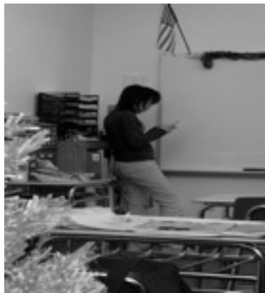
Figure 6. RS works as a single (Pierce, 2009)

At Site B, RS, never became one with the group, her language proficiency necessitating movement from one class to another. At Site B, RS stood off by herself, looking up vocabulary on her translator, working as a single who never connected with other ELLs. One photograph depicted in Figure 6 shows her standing by herself in a corner of the room using her translator to figure out something, working as a single. Her isolation is evident in her personal distance to others in the picture.