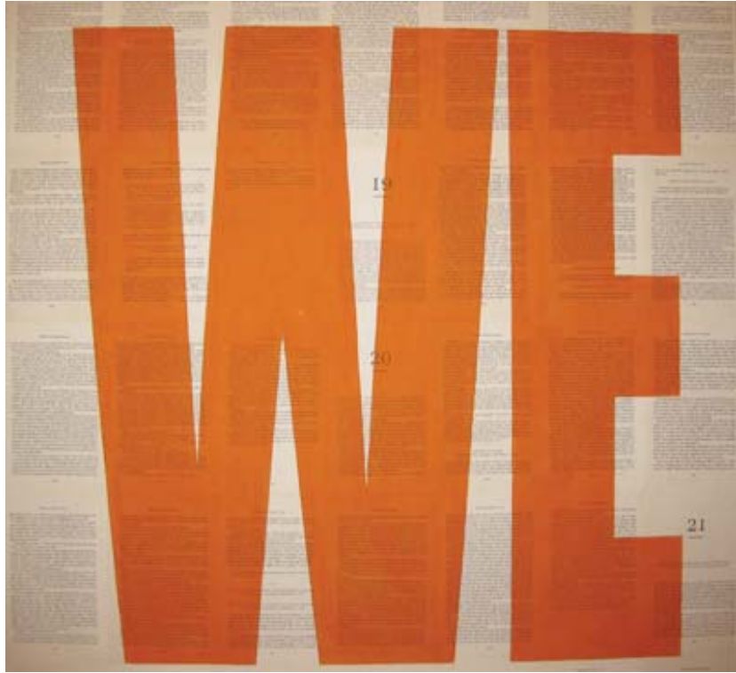
Figure 1. “WE”. Painting by students from Life Learning Academy, 2001.