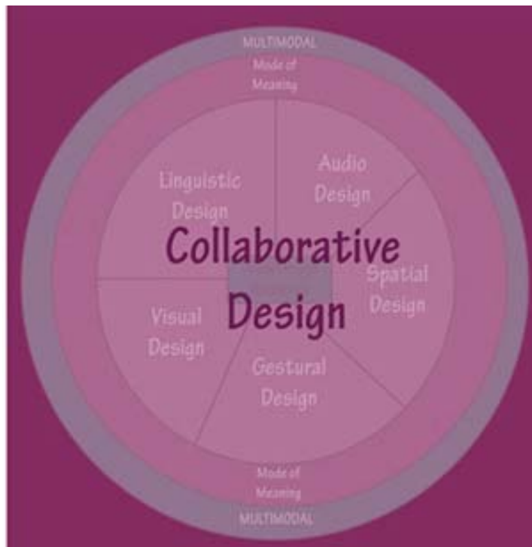
Figure 4. Debora’s re-articulation of multiliteracies in relation to “collaborative design” (Adapted from Cope & Kalantzis, 2000, p. 26)

In the process of creating Concrete Voices , Debora interrogated a number of assumptions – her own and others’ – that were symptomatic of the contexts in which she taught. These included deeply held beliefs about the abilities of her students, which were not merely insufficient accounts of their capabilities, as Debora learned, but also indicative of circulating discourses about the kinds of interventions that such youth require to be successful. As Joan Cone (2002) notes, schools commonly place adolescents like Debora’s students in remedial courses with skills-based approaches to teaching that allow few opportunities for creative intellectual work.