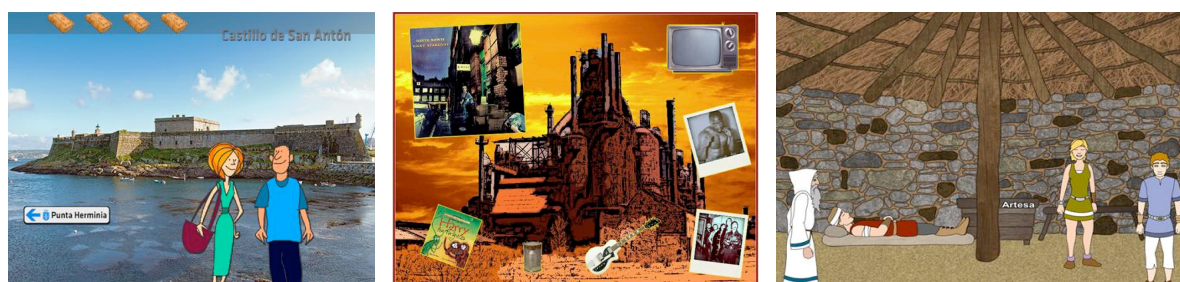
Picture 1: Screenshots of games created by teachers on History (left and right) and Rock history (middle)