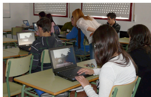
Picture 1, Picture 2: Pilot implementation of the GBL sessions in primary school (left) and secondary school (right)