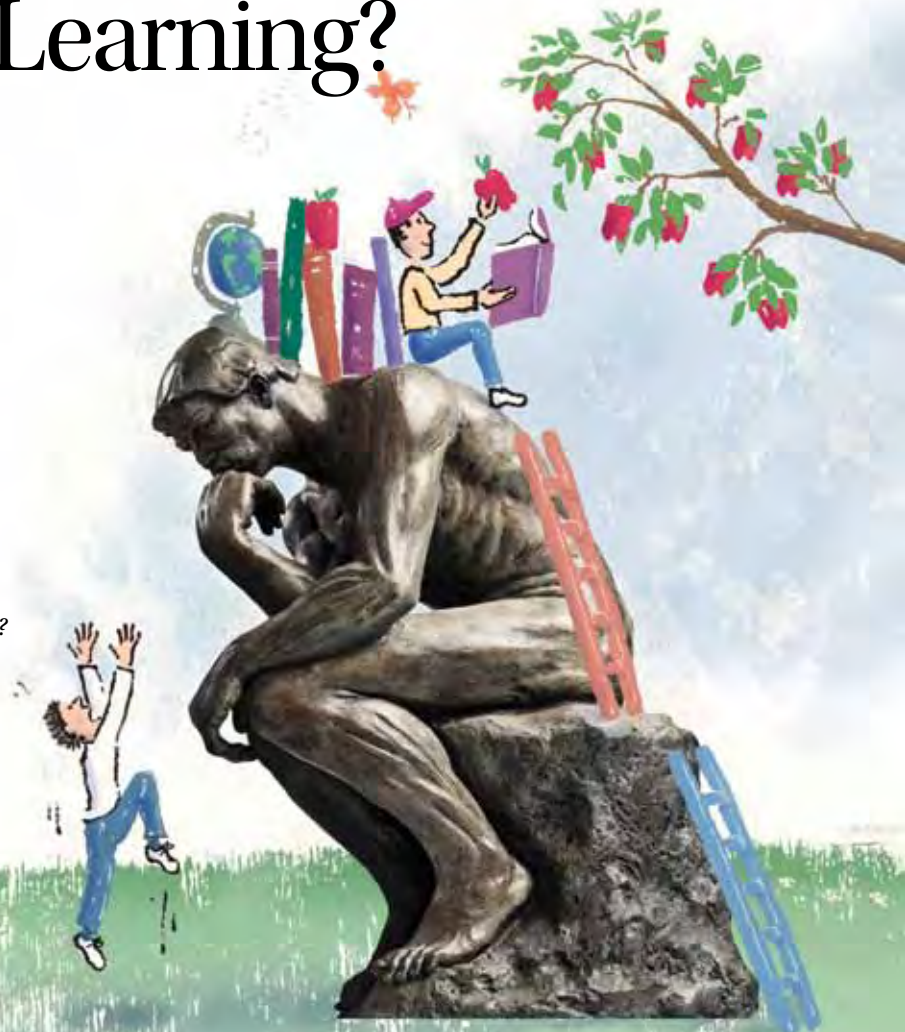
ILLUSTRATIONS BY DANIEL BAXTER

“Common knowledge” does not always turn out to be true, especially in matters relating to schooling. But when it comes to wealth and educational outcomes, common knowledge has it right: on average, kids from wealthy families do significantly better than kids from poor families. Household wealth is associated with IQ 1 and school achievement, 2 and that phenomenon is observed to varying degrees throughout the world. 3 Household wealth is associated with the likelihood of a child graduating from high school 4 and attending college. 5 With a more fine-grained analysis, we see associations with wealth in more basic academic skills like reading achievement 6 and math achievement. 7 And the association with wealth is still observed if we examine even more basic cognitive processes such as phonological awareness, 8 or the amount of information the child can keep in working memory (which is the