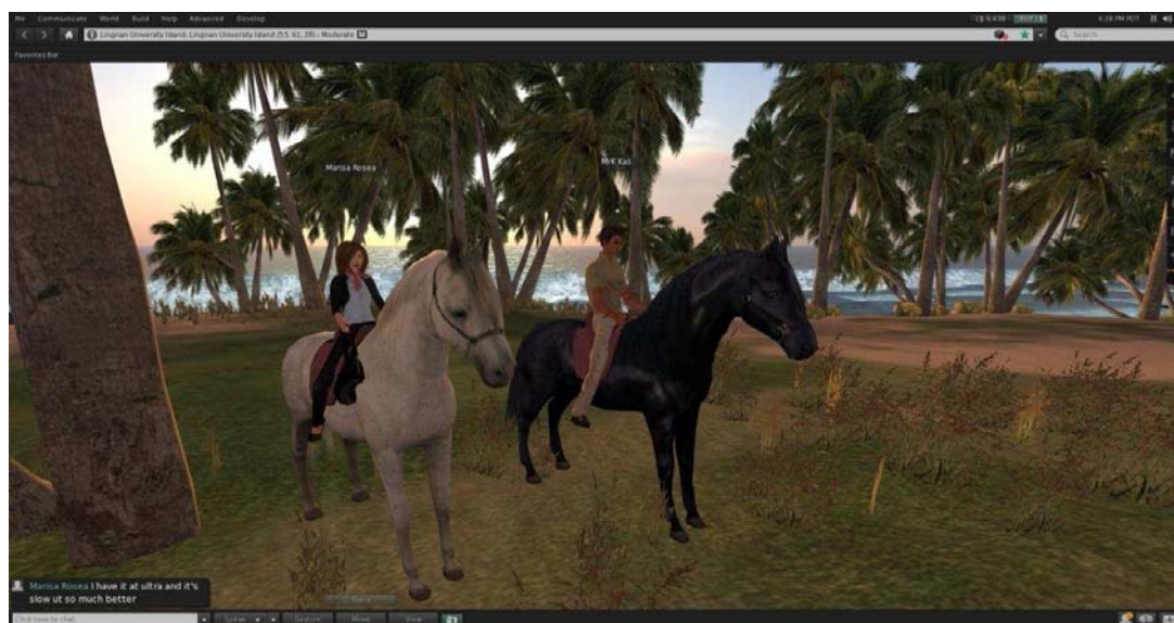
Figure 8: Riding horses is a popular activity on the Lingnan University Island in second life

perimeter. This rich environment offers a wide range of virtual activities to stimulate possible conversational scenarios between language learning partners.