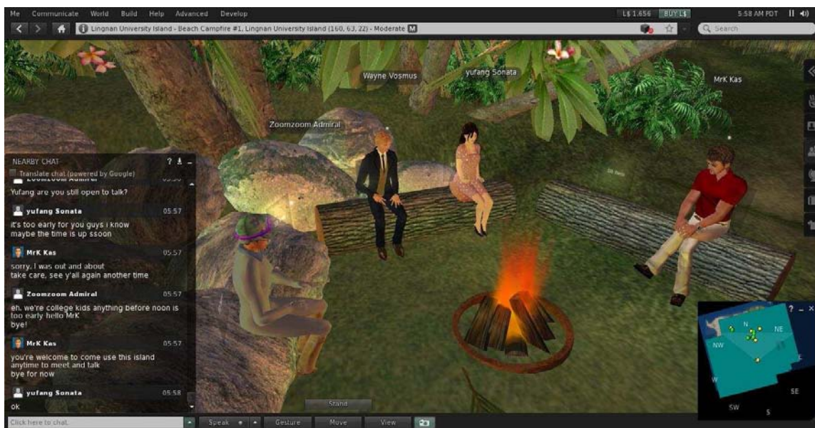
Figure 4: A beachside campfire gives students a quiet place for private chats

a free SL avatar account, students are trained in the basics of movement, navigation, interaction with the virtual environment, and communication. Students from TAMU also receive basic SL training from their instructor in Texas, and are given the link to the location of the Caddy Shack on Lingnan University Island within the SL virtual grid. Students are trained in the skills required to post documentation of their language-learning activities on discussion forums, including screen captures of encounters with their online language-learning partners and the resulting typed chat dialogue. This documentation is then available for final upload onto their e-portfolios for assessment of their Independent Learning activity by their CEAL tutors.