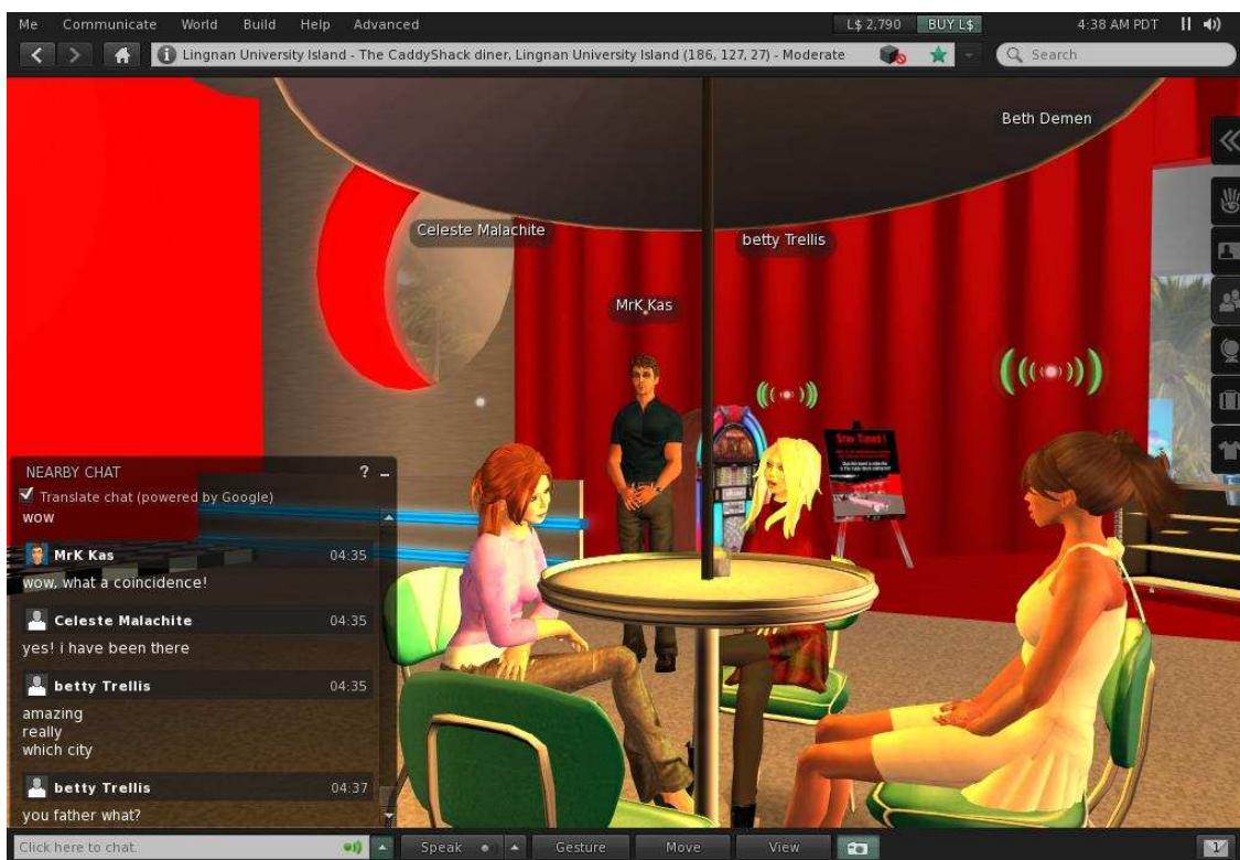
Figure 6: Hong Kong English 101 students using both audio (green arcs above the avatar indicate voice transmission) and chat in a discussion with US TESOL students