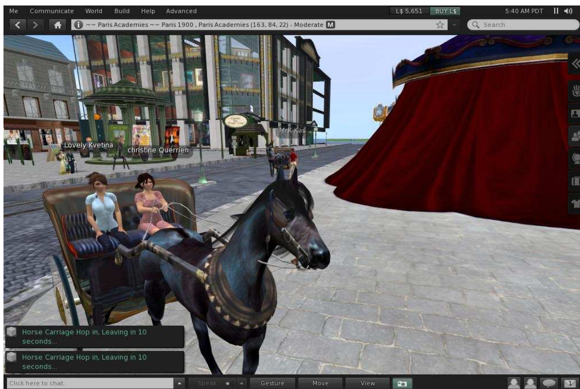
Figure 10: Here the students drive a horse-drawn carriage around the streets of Paris in 1900. Other favorite activities in this simulation were parachuting off the Eiffel tower and participating in the acrobatic circus!

During the workshops, the Global Classroom students expressed a high level of enjoyment using the virtual environment for their language-learning activities.