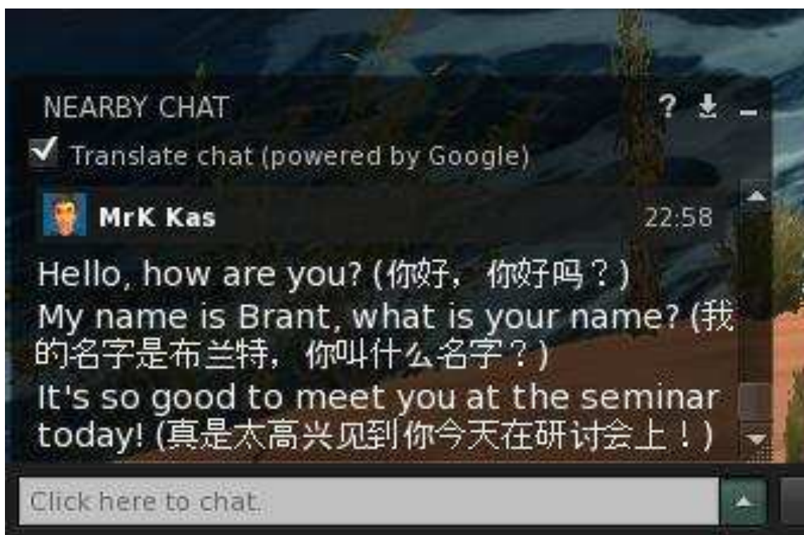
Figure 7: The new automatic machine translation of chat may prove to be a tremendous boon to language learners using the virtual environment

Other popular meeting areas included the campfires along the beach, and the rainforest simulation. The most popular non-language activities included dancing on the Caddy Shack rotating dance floor, riding the virtual horses in the meadows (Figure 8), and racing the virtual jet skis around the island