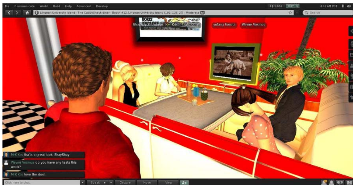
Figure 3: The vintage Philco TVs can display student-selected YouTube video clips which can be viewed by any avatars nearby. Cocktails can be served, and the avatars can simulate drinking the beverage of their choice!

protection from outside noise interference (music and other voice conversations), and privacy for those conversing inside. These booths are designed to support voice conversations using the VOIP technology built into SL, which works in a fashion similar to Skype.