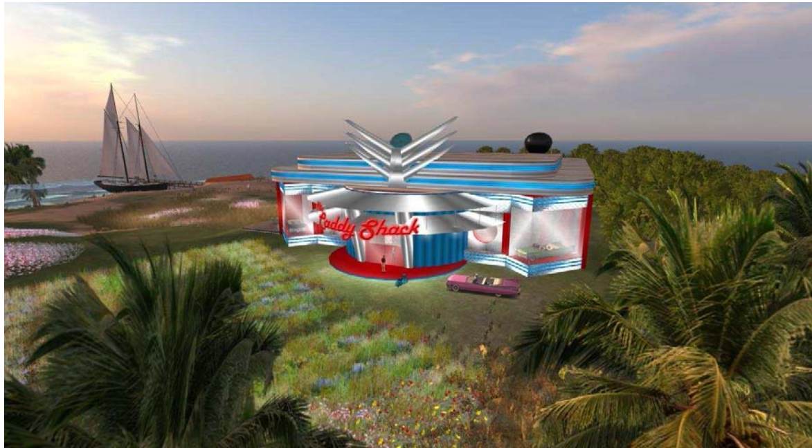
Figure 1: The Caddy Shack diner on Lingnan University Island in the second life virtual environment.