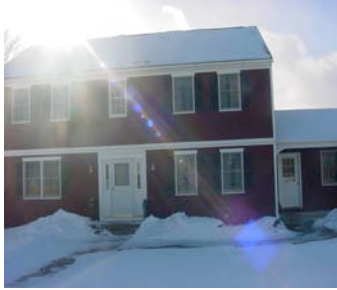
Chris's home at Pathfinder Village