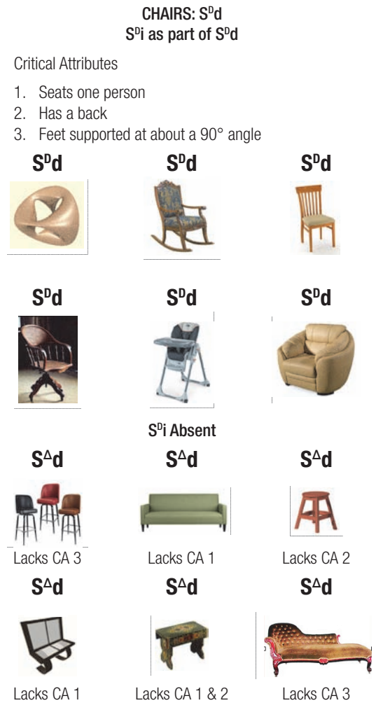
Figure 3. Conjunctive relations or concepts. Examples of chairs (S pi : seats one person, has a back, legs supported at about 90 degrees [CA 1, CA 2, and CA 3]) may be juxtaposed with non-chairs, such as stools, benches, couches, love seats, etc., displaying varying features such as number of legs, material, etc. S pi guidance can arise by reinforcing saying “chair” only in the presence of chairs or can be established by providing a written list of the attributes (S pi ) in advance. When saying “chair” occurs only as a response to chairs and not to other similar furniture, both S pd and S pi guidance has been established over the behavior of saying (the abstract tact) “chair.”

only sequences containing multiple exemplars, but sequences containing multiple juxtaposed non-exemplars (Markle, 1978; Markle & Tiemann, 1969, 1974; Tiemann & Markle, 1990; also see Englemann & Carnine, 1991) in very carefully programmed sequences (Markle, 1991). From the perspective of those interested in teaching children to comprehend text, the formulation presented here has led to exciting teaching possibilities and the development of new approaches to teaching “vocabulary” (see Sota et al., 2011 and Leon et al., 2011).