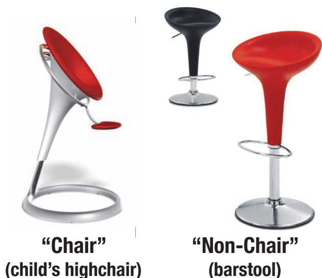
Figure 4. When we change the particular S^D to one the observer has never seen before and find the observer still says “chair”, but does not do so in the presence of a close-in non-example, we demonstrate maintaining S^D guidance while the S^D changes. We can say, “Sit on the chair,” and have the observer sit on a chair and not on the couch. We can say, “Pretend to sit on a chair,” and the observer may bend in such a way as to resemble sitting on a chair, though no chair ( S^D ) is present. This represents S^D control in the absence of S^D .

believes that Y.” Once the abstract tact “believe” is established, many other textual stimuli can be substituted in this frame. “Believe” has two critical features that define the S^D guidance: first, the absence of an event, and second, action taken to affirm existence of the event. To teach a young learner the concept of believing would require a minimal teaching set of six examples and two non-examples (see Figures 6 & 7). The six exemplars are determined by an analysis of the range of varying features found in statements of belief. The two non-examples are determined by the number of critical features such that when one is removed, “believe” is no longer defined (see Sota et al., 2011 and Tiemann & Markle, 1990, for further discussion). By ensuring the greatest range of generic extension for “believe,” we ensure the greatest range of autoclitic frame guidance. All of this is part of building a verbal repertoire that is necessary to comprehend text. A range of procedures can expand and extend verbal repertoires where required (see Leon et al. 2011; Sota et al., 2011; for an elaboration, see also Alesi, 1998 and Shahan & Chase, 2002).