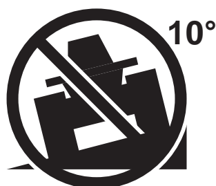
Figure 1. A safety label from a ride-on lawnmower.

There is a real danger of a roll-over when using a ride-on mower across steeply sloping ground. Travelling up or down a slope is much safer but not always practical. Manufacturers are required to publish safety guidelines and make the information readily available to users. One important piece of information is the maximum slope across which the mower can be driven safely. Some manufacturers insist that their machines never be driven across the slope; others vary from 5^\circ to 17^\circ . One popular manufacturer recommends that the mower should not be driven along a slope of greater than 10^\circ (see Figure 1). Here is the problem: how to measure a slope?