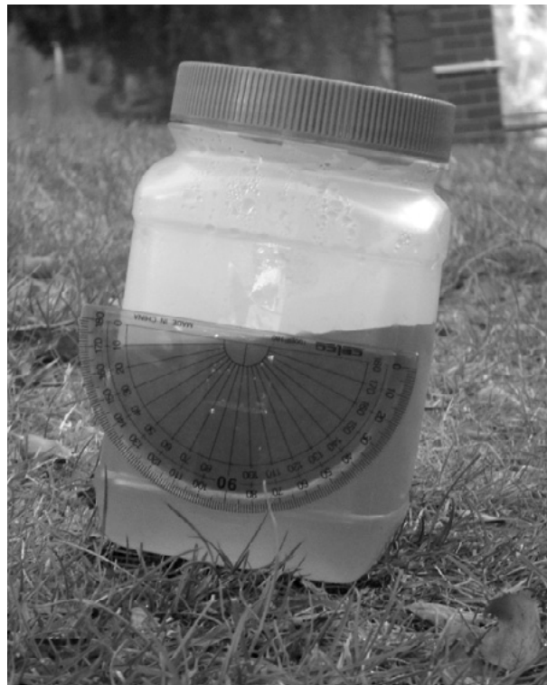
Figure 5. Some students may prefer the protractor option.

What needs to follow in the classroom will be a session or two of construction. The materials list from the previous lesson will vary but should include such items as: string, water, various containers, pieces of timber or cardboard, and nuts (as in nuts and bolts), as well as various tools for marking, measuring and cutting, and the necessary glues, tapes and fasteners to hold it all together. It should be expected that each group will want to use a protractor somewhere in the construction process. It may be used either directly as the scale or in order to determine some reference points that are marked on the device. It is, of course, up to the teacher to allow the use of a protractor and it will depend on the nature of the group and the teacher's intention in using this task.