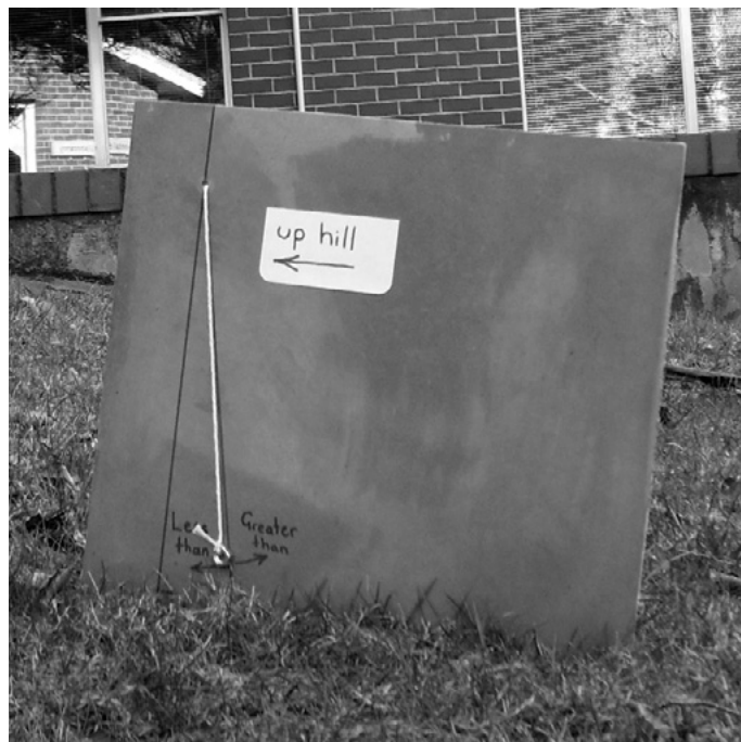
Figure 3. A student's solution using a vertical reference.

There are many possible solutions to this problem and the more times this activity is done, more solutions will be found. Each effective solution, however, will involve the creation of some kind of measuring device. This process will probably take up the bulk of a single lesson and it might be appropriate at this stage to instruct each group to determine a list of materials needed for their device as a conclusion to the lesson.