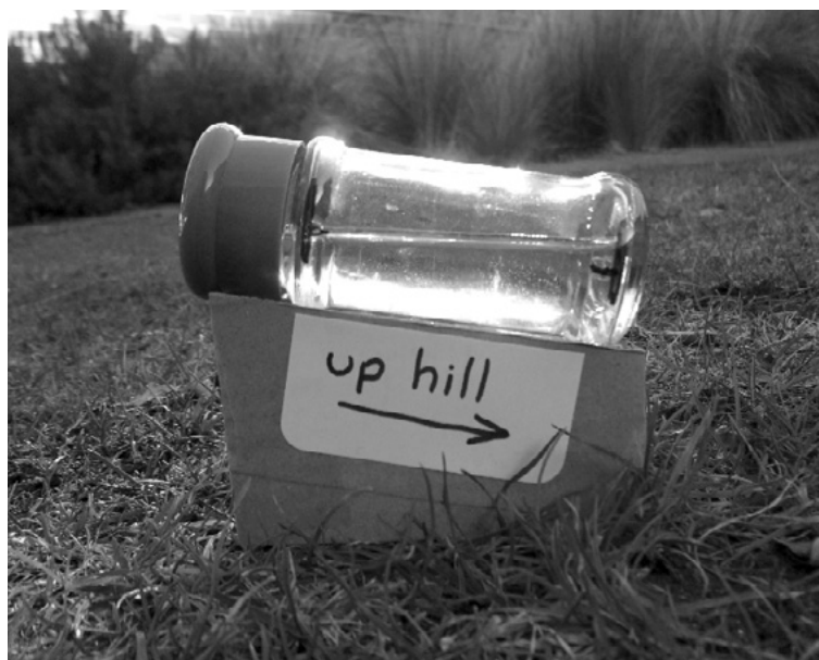
Figure 6. Another student solution. The reference marks on the jar indicate 10 degrees. The arrow shows the user how to orientate this device to the slope.

An important part of the investigation is the testing phase, which should happen as a part of the construction rather than after construction has finished. The opportunity to refine the design is essential to both the success of the device and the students' understanding of invention. A few appropriate locations around the school yard can be set up as testing sites. The slope at these locations should be accurately measured first by the teacher. When each group is ready to test they take their device to the site and use it to determine whether the slope is greater or less than 10^\circ . Their test will determine not only accuracy but also how easy the device is to use.