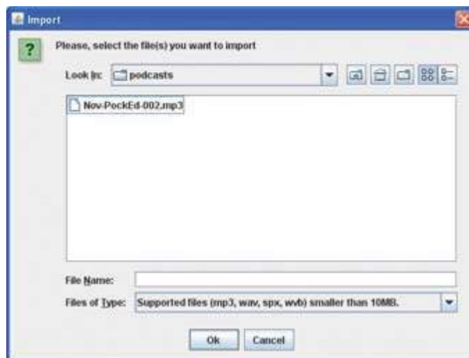
Figure 3. VB file upload screen.

Students had to upload their listening tasks to the virtual staffroom VB, so that they were all in one place to be shared with their peers and tutor (Figure 4). The VB was used by their tutor (E) to give formative feedback. Students were given three days to use the VB to supply feedback on at least two of their peers' work. As the task required students to evaluate the listening tasks of other students in their own time, a synchronous audio tool would not have been appropriate. The following questions were supplied for them to reflect on when reviewing their peers' work: