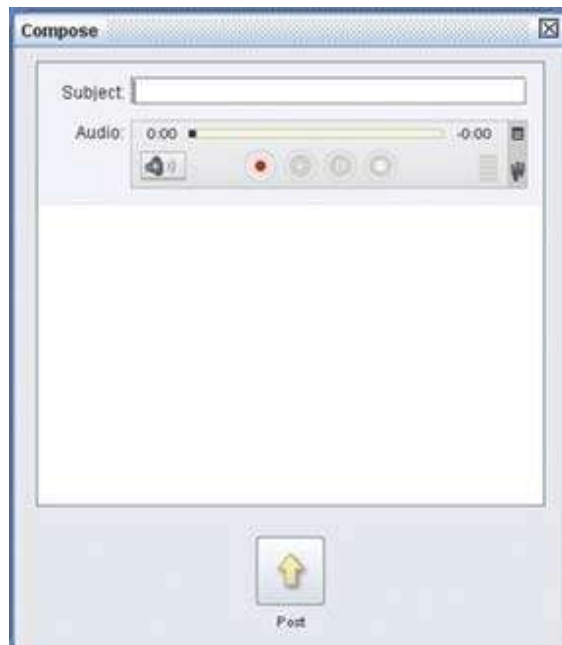
Figure 2. VB new message screen.