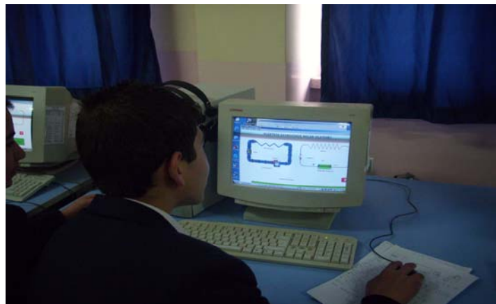
Figure 2. Sample of analogy-based simulation environment for control group II in a computerized classroom of Turkish elementary school.