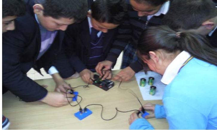
Figure 1. Sample of laboratory environment for control group I in a classroom of Turkish elementary school

2. Analogy-based simulation Environment for Control Group II: Students assigned to the Analogy-simulation Environment tried to learn the basic concepts of circuit and the relationship among them in a computerized classroom with an online electricity analogy-based simulation, the ‘Electricity Analogy-based Simulation Tool (EAST)’ (see Figure 2 and 3). The activities in EAST were developed by originating the analogy of fluid system of Hewitt (1987) in virtual environment.