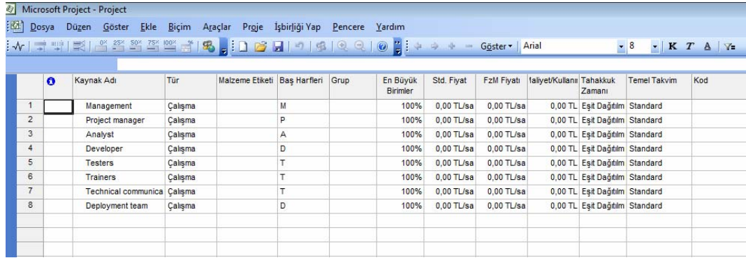
Figure 2: MS-Project resource assignments