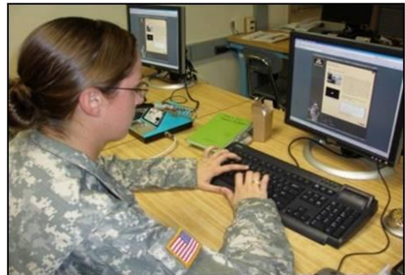
Figure 2: Taking the Leader Challenge

"Just days ago you learned that the only child of one of your NCOs passed away from a long-term illness. This terrible incident has come at a difficult time -- your unit is preparing to deploy to OIF 2 in three months. You are the Company Commander, and you have little experience handling issues of death and bereavement. You face a number of difficult dilemmas. First, naturally, you are concerned about his and the family's well-being. What kind of support team will you create to take care of the family now and while you are deployed? Second, the NCO holds an important position in the company. He is well-respected and a valuable member of your company, and you must make a decision regarding his