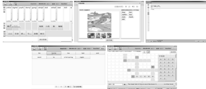
Figure 2. Snapshots of vocabulary exercises

There were 5 sub-exercises for each set of vocabulary exercises: matching, filling in the blanks, spelling, unscrambling sentences, and crossword puzzle. An on-screen version with a different visual exposure was prepared for the computer group (see Figure 2 below). The vocabulary tests included one pretest in the form of a recognition checklist and two posttests, immediate and delayed ones, which were composed of recognition and production parts. The post questionnaire was designed to explore learners' perceptions of learning in a computer-supported collaborative environment, with some open-ended questions included.