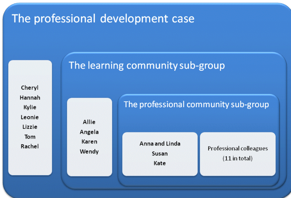
Figure 1. Embedded case design.

second level of embedded cases, the professional community subgroup, comprises a nested group of four teachers within the learning community subgroup; these four teachers add depth to the study by including data from their school communities of practice. This nested design, with embedded case studies, enables a deeper level of analysis than is possible across the holistic case. All 15 teachers contributed to an overall understanding of how teachers learn, and where they situate their learning as they engage in online professional development. The purpose of the embedded cases was not to condense teachers' experiences into a homogenous explanation of what it means to engage in online professional development, but rather to identify and illustrate the various experiences, issues, dilemmas, and impacts that contribute in some way to teachers' professional learning in, and between, communities.