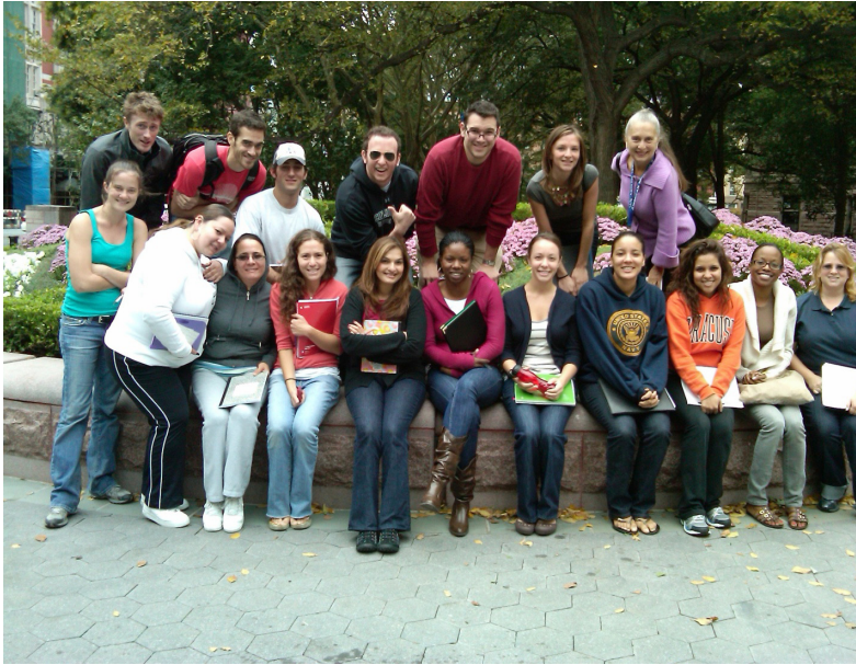
Figure 3. Lehman college teacher-participants at AMNH, Fall 2009

the value of Museum exhibits in providing interactive learning opportunities that are often missing for urban students.