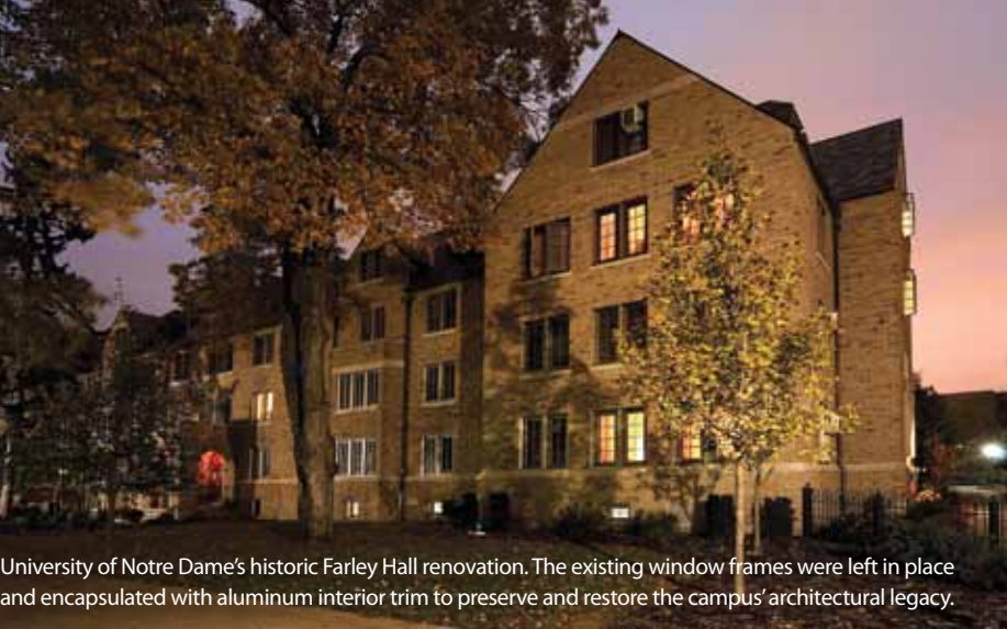
University of Notre Dame's historic Farley Hall renovation. The existing window frames were left in place and encapsulated with aluminum interior trim to preserve and restore the campus' architectural legacy.