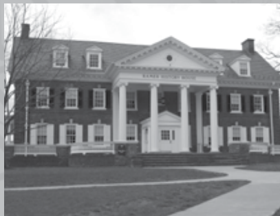
Lafayette College Interior Adaptive Reuse

New Construction • Renovation • Additions • Adaptive Reuse Preservation • Masonry Stabilization • Structural Intervention