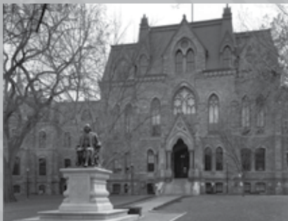
University of Pennsylvania Historic Stone Facade Repairs

Solving structural challenges for colleges & universities since 1953