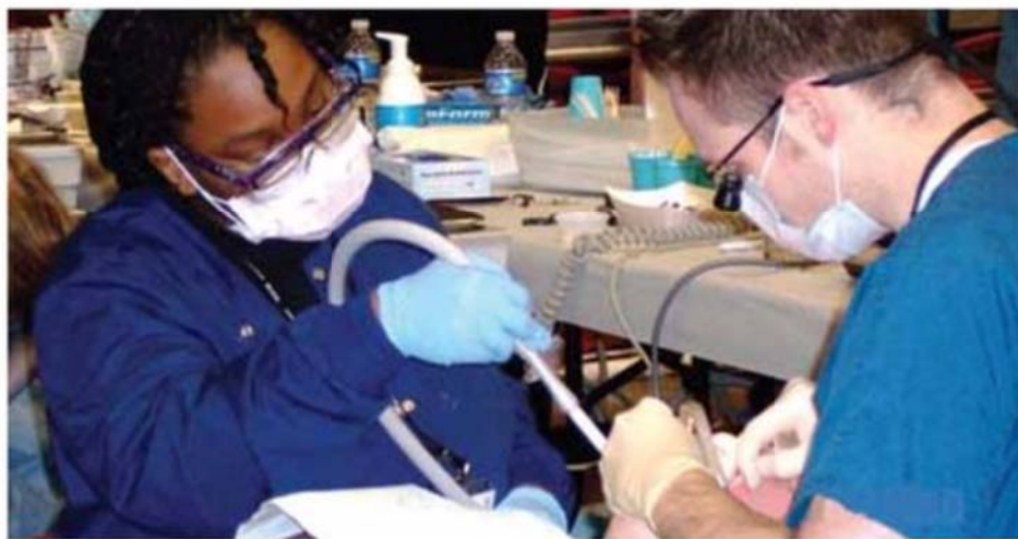
Tulsa Tech dental assistant students get hands-on experience through Oklahoma's first Mission of Mercy.