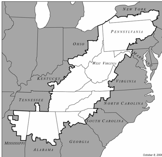
Figure 1: Map of Appalachia

increased prevalence of behavioral risk factors (Halverson, Ma, & Harner, 2004). In terms of cancer, Appalachia has elevated incidence and mortality from cancers of the lung, colon, rectum, and cervix, as well as a high percentage of cancers diagnosed at a late stage when the prognosis is poor (ACCN, 2009; Huang, Wyatt, Tucker, Bottorff, Lengerich, & Hall, 2002; Lengerich, Tucker, Powell, Colsher, Lehman, Ward, Siedlecki, & Wyatt, 2005).