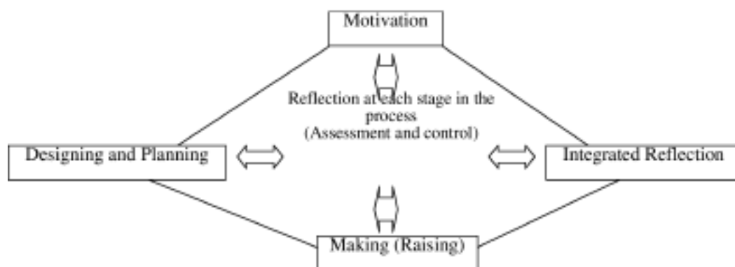
Figure 1. Systems approach of technological problem solving in action

We propose technological processing as a fifth curricular theme closely associated with technology education (see Figure 1).