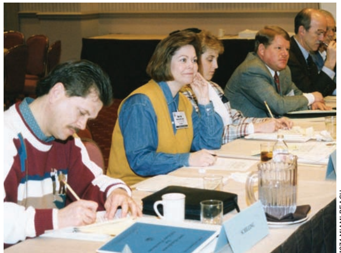
1974 MIAMI BEACH

The realm of school business is so vast that it can be daunting, especially to those who have recently joined