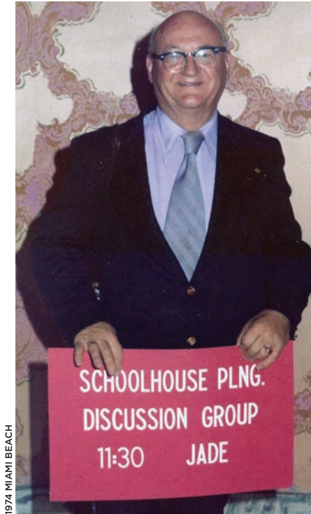
1974 MIAMI BEACH

How fitting that in 2010—the 100th anniversary of ASBO’s inception—ASBO will launch the certification program focusing on identifying competent school business officials who are responsible for school business finances and business operations.