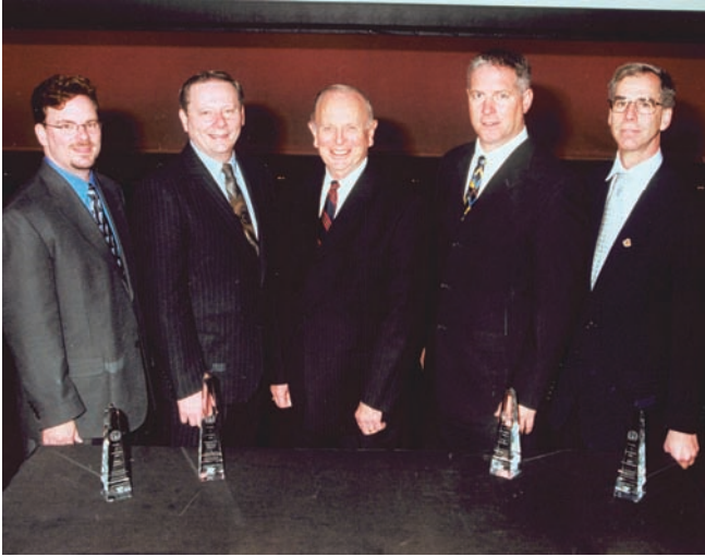
PINNACLE AWARD RECIPIENTS, MARCH 2003