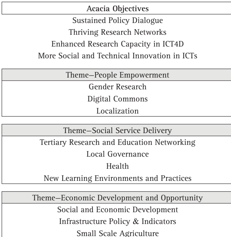
Figure 2. Acacia Initiative development framework. Adapted from IDRC, 2006.

Our analysis of the IDRC mission and goals for the Acacia Initiative shows that higher education holds a central position within the research themes of the program, both in terms of the stated objectives and also in the overall development framework utilized. The Initiative has three central themes: people empowerment, social service delivery, and economic development/opportunity. Open access publishing models, as well as other aspects of ICT and scholarly communications, are included in the “Digital Commons” under the first theme “People Empowerment.” Higher education is explicitly mentioned within the second theme, “Social Service Delivery,” as “Tertiary Research and Education Networking” (see Figure 2).