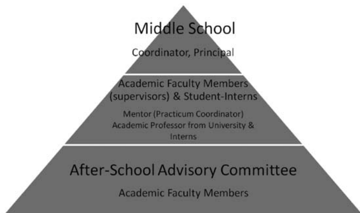
Figure 2 Youth Fitness and Nutrition After-School Organizational Structure

The interns completed their metadiscrete field experience by