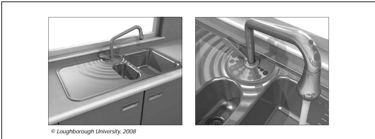
Figure 4. Reactive Indicator Tap and Tapered Sink

contravention of Berdichevsky and Neuenschwander's heuristics of ethical persuasion (1999).