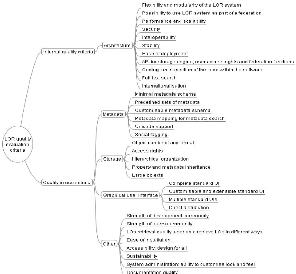
Figure 1: Quality criteria for the evaluation of LORs

The authors' comprehensive LOR quality evaluation tool is presented in Figure 1.