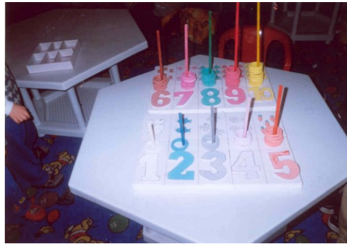
Fig.3. To prepare exercises on classification and ordering