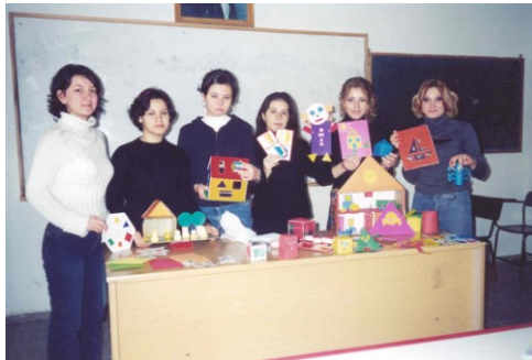
Fig.4. Creating opportunities for the groups to present the concrete materials