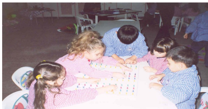
Fig.6. The application of these presentations idea pre-school institutions - 2