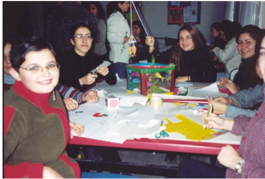
Fig.2. Doing group work and providing the preparation of activities