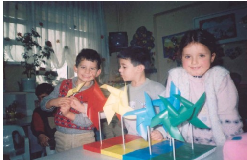
Fig.5. The application of these presentations idea pre-school institutions - 1