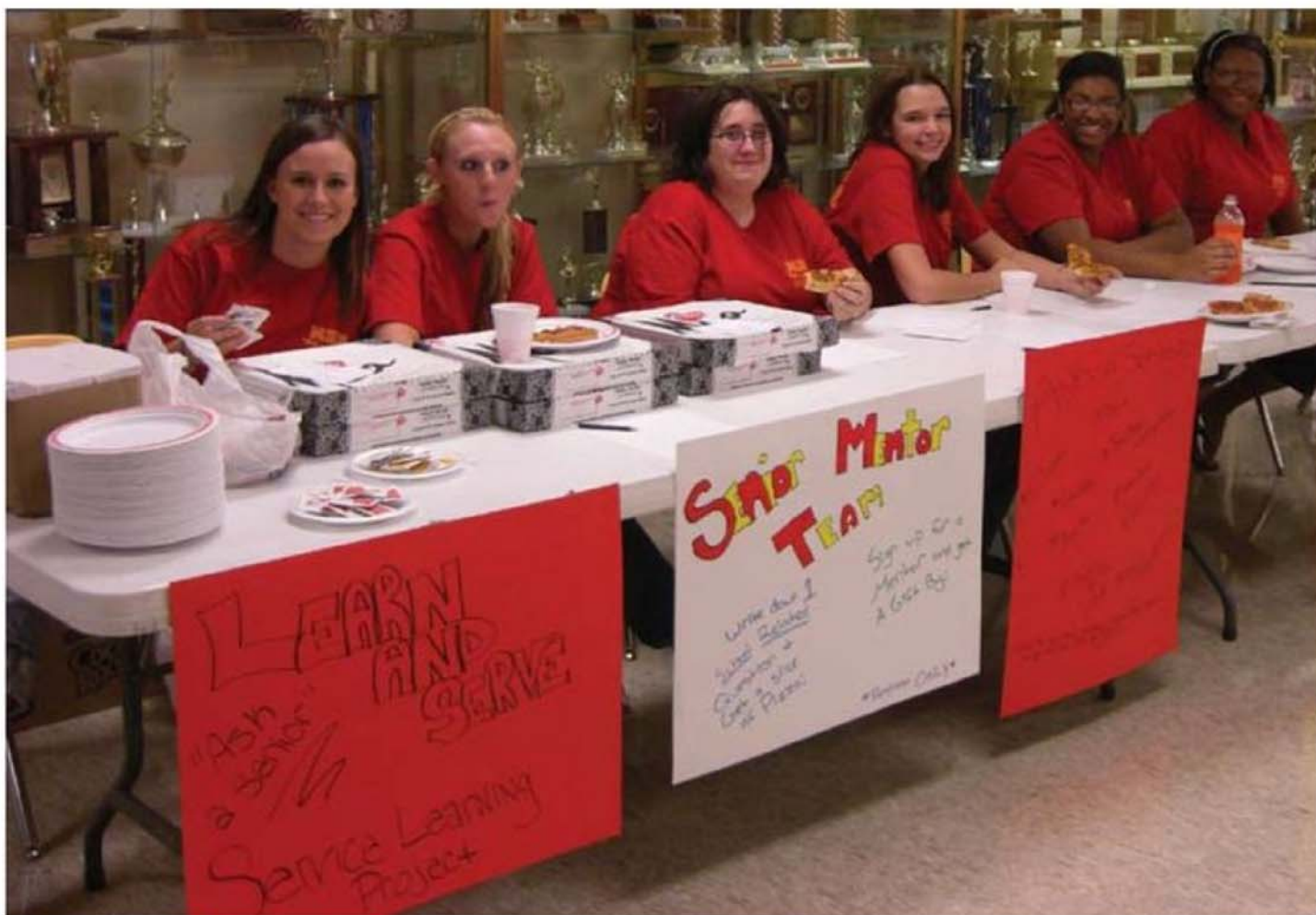
PHOTO COURTESY OF ORLAN BROWN, SOCIAL STUDIES TEACHER AT MURPHYSBORO HIGH SCHOOL IN MURPHYSBORO, ILLINOIS.