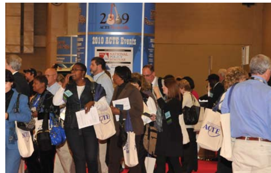
▲ Attendees at the Annual Convention flocked to the exhibition hall.