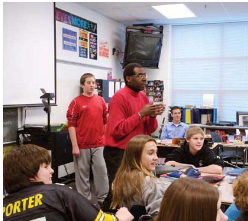
Teachers can best develop empathy for students when they are aware of their own personal and cultural biases.

Programs such as Facing History and Ourselves ( www.facinghistory.org ) and Rethinking Schools ( www.rethinkingschools.com ) provide curricular materials that are designed to provide these kinds of shared self-examination experiences in the classroom. Facing History and Ourselves engages students from diverse backgrounds in an examination of racism and prejudice to promote a more informed and tolerant citizenship. Through study and discussions of current and past historical events, students are encouraged to analyze their own thinking, see the world from more than one perspective, and place themselves in someone else's shoes as they examine events from history around the world. Together, students and teachers struggle to form judgments about human behaviors. Curricular materials expose students to such topics as violence in Northern Ireland, genocide in Cambodia, AIDS victims in Africa, anti-Semitism in London, or Mexican immigration struggles in California. Even though many of these events may occur miles away in different states and different countries, many of the core