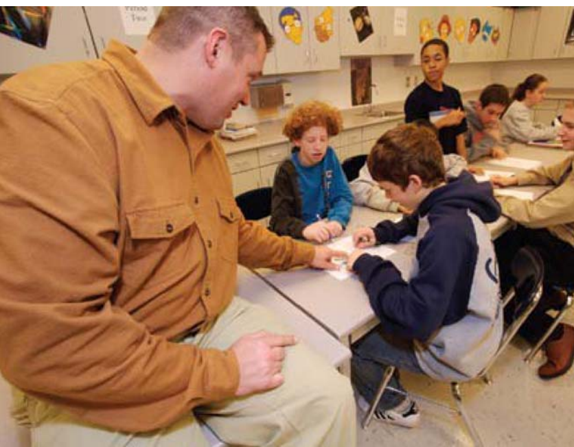
Teachers who truly understand young adolescent learners are best able to build strong relationships with students.

Rather than engage in a power struggle with such a student, a teacher should acknowledge the skill that the student has worked so hard to develop—and then redirect it. Give her credit for all of the years she has practiced the skill. This will also lead to an increase in the student’s perceived empathy from the teacher. After acknowledging the skill, reframe the skill and then redirect it. It is important that this skill be applied with sincerity. Any hint of sarcasm could lead to further alienation between the student and the teacher.