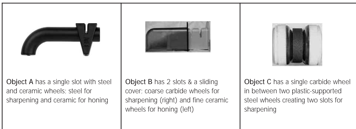
Figure 1. Artefacts used in the study