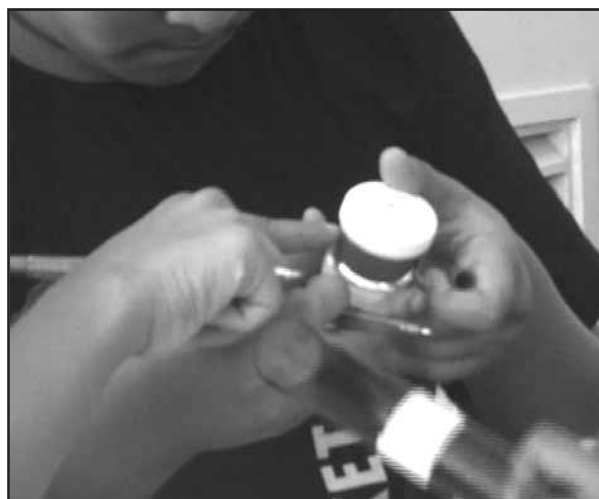
Figure 3. A student pointing at 'C'

One important strategy utilised by the students of Groups 1, 2 and 3 was in dealing with the question of whether there was any similarity among the three artefacts. For example the most obvious similarities between 'A' and 'B' were the presence of slots and the orientation of wheels within those slots. The obvious similarity between 'B' and 'C' was the sharpening material used. There was no obvious structural similarity between 'C' and 'A'. Both the girls' groups (1 and 2) made use of the above similarities in identifying the function of 'A', 'B' and 'C'. Although other groups did find a few similarities among the three artefacts, these were limited to the material and the superficial appearance of the artefacts.