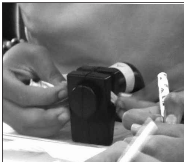
Figure 5. Probing slot of 'A' with handkerchief

It was found that students in all the groups contributed in identifying the functions of the artefacts. However the level of participation of students differed among groups. In both the girls' groups (1 and 2) all the girls equally contributed to the identification process through active discussions and handling of artefacts. Among the boys' groups (3, 4 and 5), one student in each of these groups was less interactive and made hardly any contribution to their