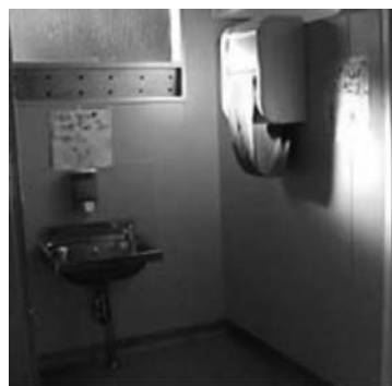
Picture retrieved Dec 2008 from http://www.technion.org.nz/Case-studies/Classroom-practice/archive-2006/nicer-loos/page7.htm

During a discussion about a lunchtime ‘toilet’ incident, students in a year 3-4 class (age 7 or 8) identified that there were problems with regards to the toilets. There was general agreement that the toilets were unpleasant to use and from this the teacher and students decided they should do something about them. To achieve a successful outcome, the teacher developed a range of learning experiences related to technology, the arts, maths and English. They worked with a number of ‘experts’ from the local community to learn art concepts and practices, science understandings, explore health issues and people’s response to these. They brought all these together within technological practice to make an informed and sustainable change to their school toilets. In so doing, these students met specific learning outcomes from science, health and physical education as well as technology.