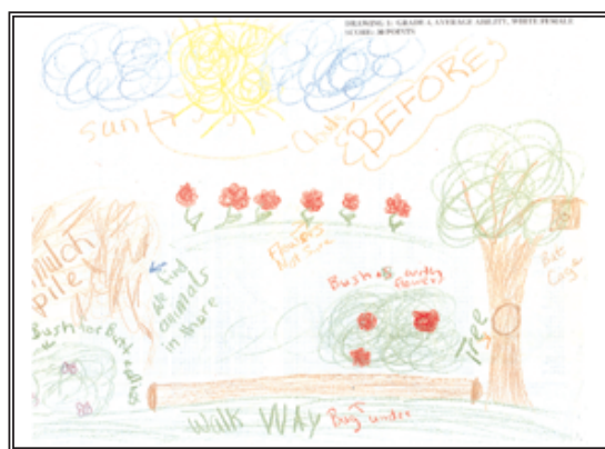
Figure 1. Grade 4, Average Ability, White Female. Score: 30 Points

Figure 1 was completed by a fourth grade, average ability, White, female student. Her drawing's average total score for the three raters was 30 out of 35 points. Virtually the entire drawing is covered with features; she included at least 10 different features in her drawing; she drew a few features, such as flowers and bushes, more than once; she clearly emphasized the natural features of her schoolyard habitat; she focused on the broader system rather than one small component; she used many descriptive words and phrases; and except for the fact that she drew only one tree, her drawing very closely matches her actual school site's features. Interestingly, this student's schoolyard habitat was destroyed about three months before this drawing was completed due to the installation of portable classroom buildings, explaining the large label "BEFORE" in the top right section of her drawing. This drawing reflects a very accurate memory of a site she had not seen for several months.