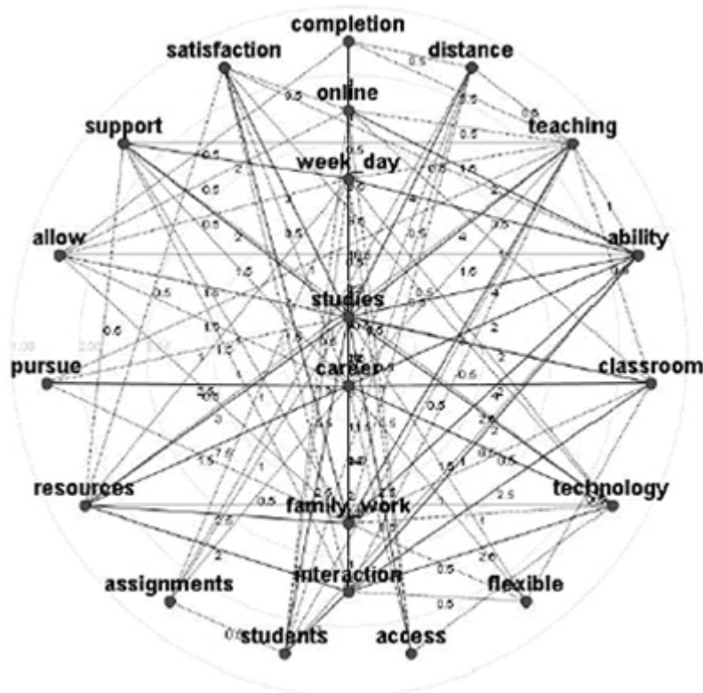
Figure 1: Students’ Views on ALN [83]

Back in 1967, when The Beatles’ working class heroes found school inhospitable, less attention was paid to student satisfaction. Today we are realizing that satisfaction with all aspects of the learning experience—academic challenge, fairness, and relevance; substantive, constructive interaction; support services and resources—motivates people to continue studies. Improving success rates in the still young field of ALN depends on understanding and rewarding learners’ perspectives.