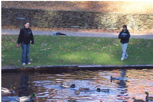
Figure. 1. A test for despotism behavior using Mallard ducks. Ducks are fed equal sized pieces of bread in two patches of different profitability. One patch is a "poor" patch, while the other is a "rich" patch with twice the profitability as the poor patch.

This field exercise is designed to examine how ducks distribute themselves relative to their resources (ideal freely, or despotically). In this exercise, students will present ducks with bread distributed into two patches (a rich patch and a poor patch, Figure 1). Students will test the prediction that competitors will distribute themselves such that the number of individuals per patch is proportional to the fraction of resources in that patch. Students will also test to see if the assumption of equal competitive abilities among ducks is met, and if despotism occurs in ducks.