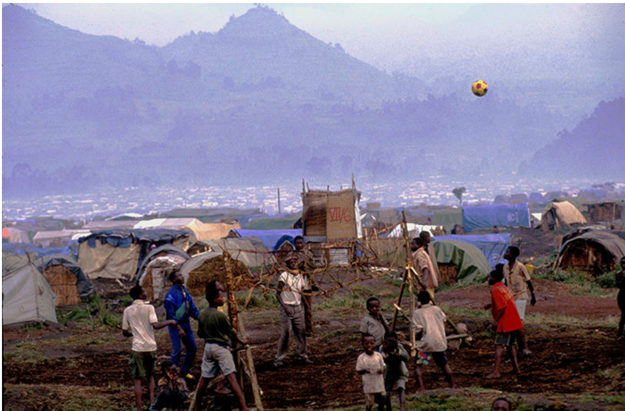
At the Kibumba Refugee Camp in Zaire, now the Democratic Republic of Congo, Hutu boys play volley ball with a net they made from vines. Behind them 800,000 Hutus live in tents. It is just after the genocide in Rwanda and the camp is a violent place for the boys to be and there are many deaths. It is too dangerous for humanitarian aid workers to visit the camp.

been overlooked in emergency settings and has been seen as an area that can only be considered as part of long-term development strategies. Humanitarian donors traditionally do not focus their funding on education, or focus only on school reconstruction and supplies. Appropriate education interventions in emergencies need to focus on quality and content, rather than solely on access and infrastructure, through investments in teacher training, curriculum development, and the development of schools as safe areas” (2005, p. 10). Education has the potential to keep children alive and increases the possibilities for children to recover from mass trauma. Teachers have an important role to play whether we are at peace or war.