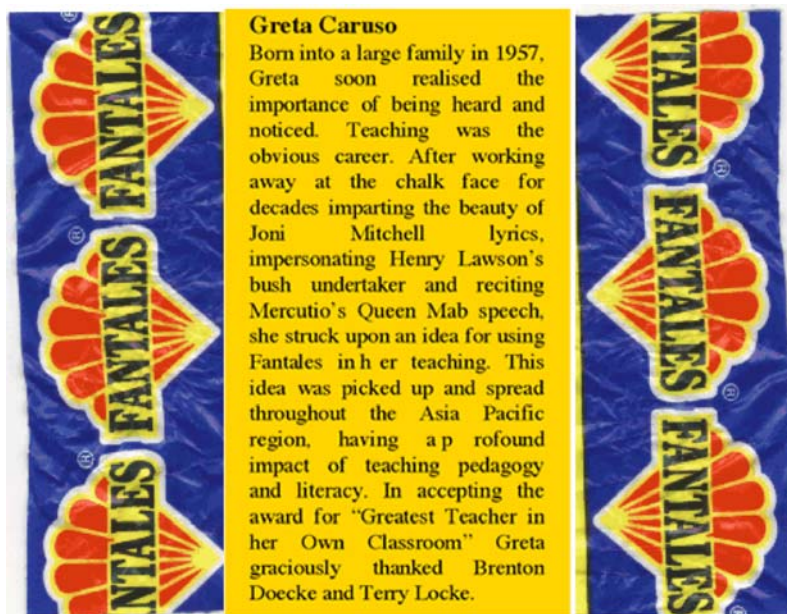
Figure 1. The writer's fantasy