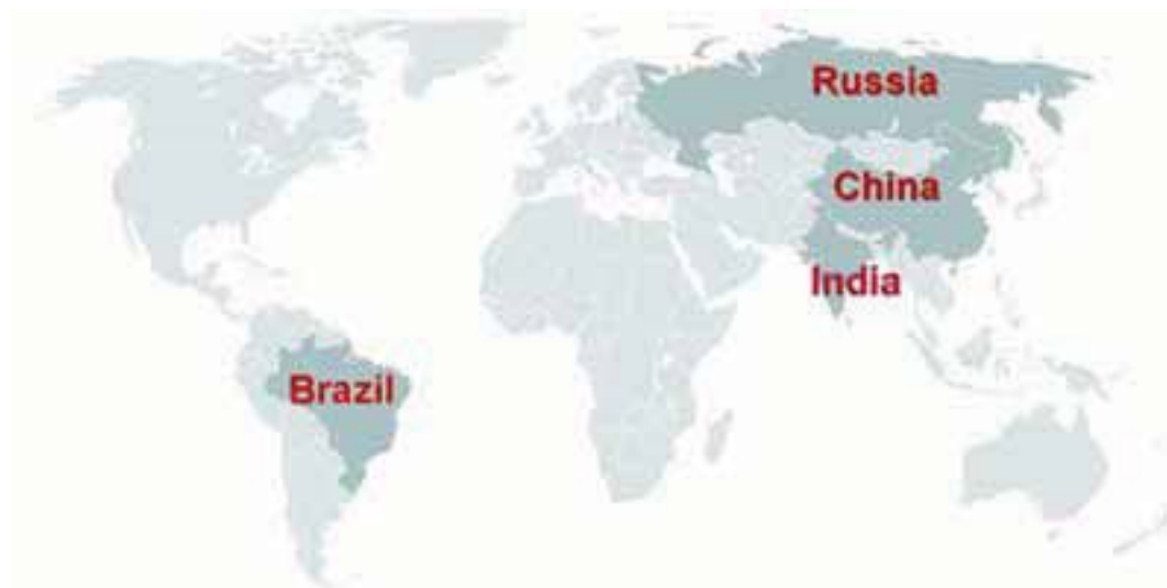
Figure 1. The BRIC Nations of Brazil, Russian Federation, India, and China are Recognized as the Next Leading Forces in the Global Economy.

UNICEF (n.d.) provides statistics on all of the BRIC nations as noted in Table 2 for years 2004 and 2005. Three of the BRIC nations—Brazil, China, and the Russian Federation—are represented in statistical gathering of World Education Indicators (WEI or WEI Programme), as indicated for years up to 2003. The WEI Programme includes 16 other countries, as well, for what the sponsoring organizations call coverage of “over 70% of the world’s population” [41].