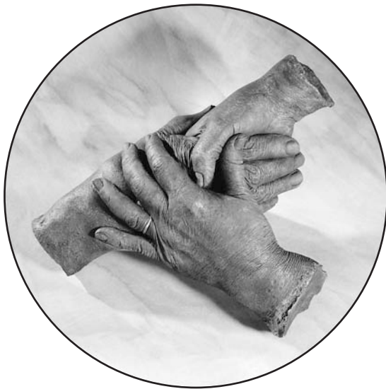
Figure 2 Sample photograph of the couple's hand casting