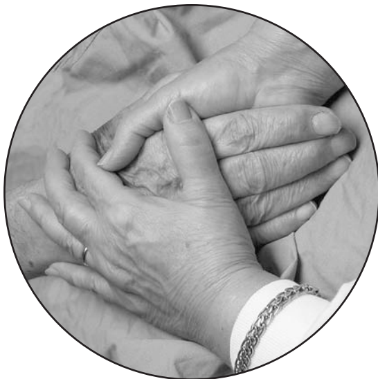
Figure 1 Sample photograph of a couple's pose