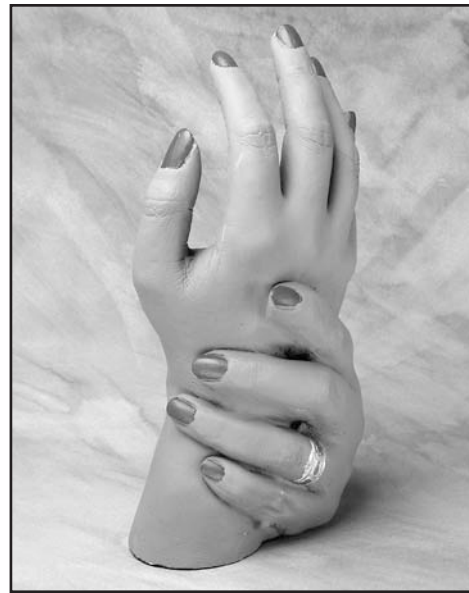
Figure 5 End result

particular position. Or I can offer a directive: Find a gesture that is meaningful to you. Find a pose that is symbolic and representative of your relationship with your loved ones.