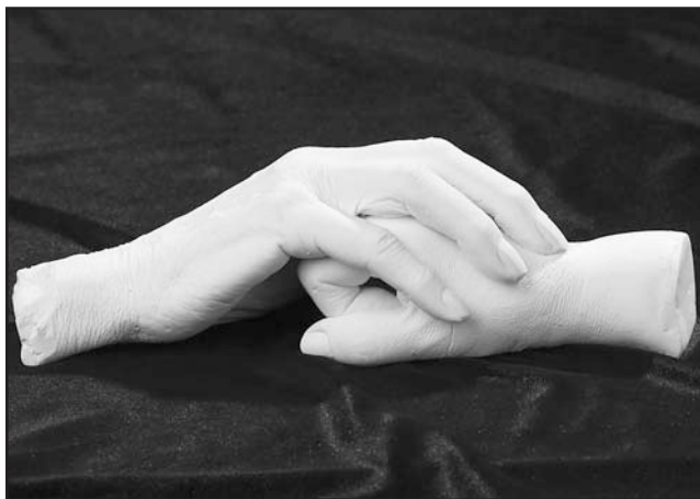
Figure 3 Sample photograph of hand casting, mother and child

would produce a duplication of the hand position. One family member was intrigued by these results and asked if she could keep the plaster copy of her mother's hand. She claimed that as she touched and rested her hand on the replica she could feel the presence and reassurance of her mother. From her comments I recognized the significance and emotional component of the hand castings beyond the process and experience of making molds with my patients.