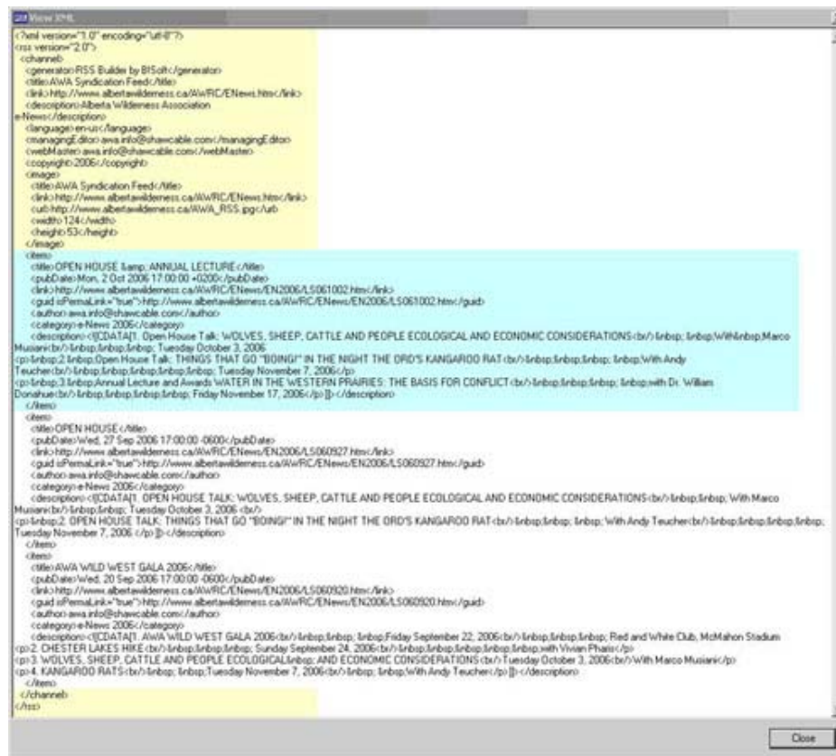
Figure 3. The XML preview window in RSS Builder displays machine readable format created from field entries in Figure 2. The XML highlighted in yellow represents then channel fields from the left area displayed in Figure 2. The XML highlighted in blue represents the first item fields from the right area displayed in Figure 2. Figure 1 is the resultant presentation for the end-user.

My recommendation is to choose the RSS editor that suites your taste. If you prefer an ASCII editor to produce the output in Figure 3, for eventual display in an RSS feed (as in Figure 1), then bon courage. For myself, however, I will stay with RSS Builder as long as it continues to be updated. The author seems to be very conscientious in responding to my inquiries in a timely manner (always a good sign). There appear to be a few other possibilities on the horizon for RSS editors, but I leave that for another discussion.