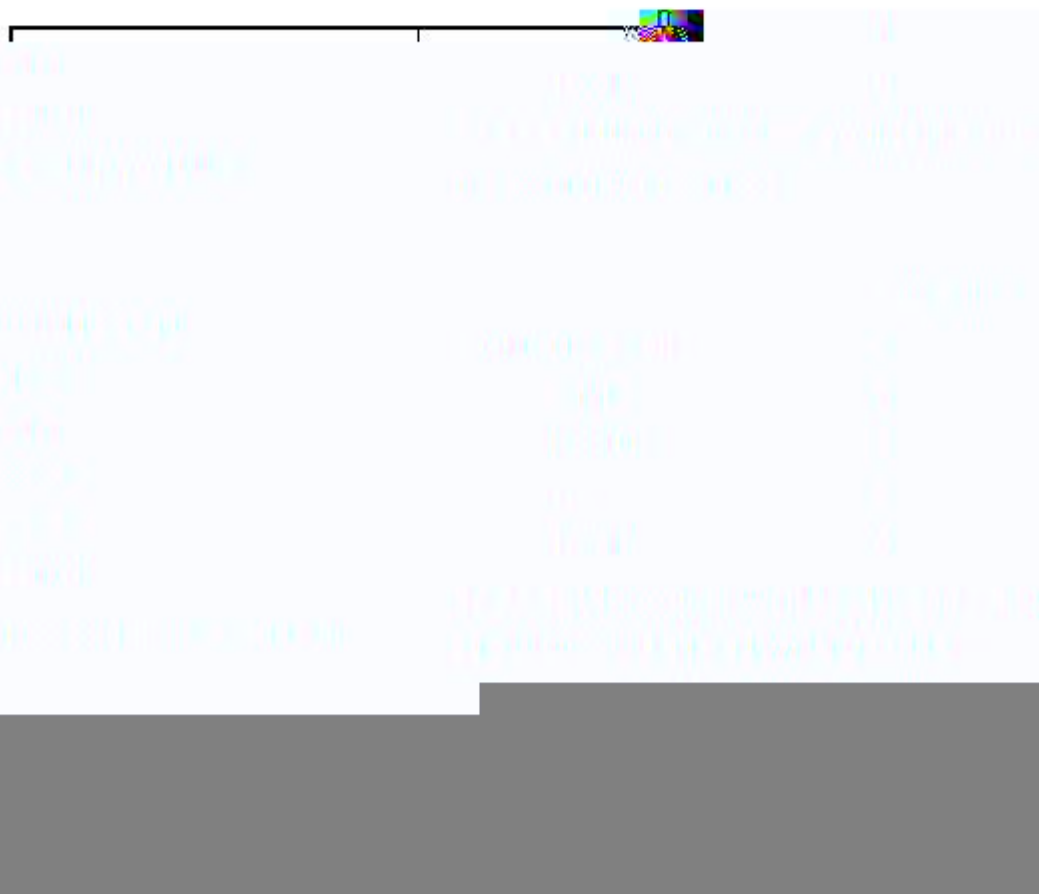
Table 11: How much does your regional centre help you with general administration and logistical arrangements?