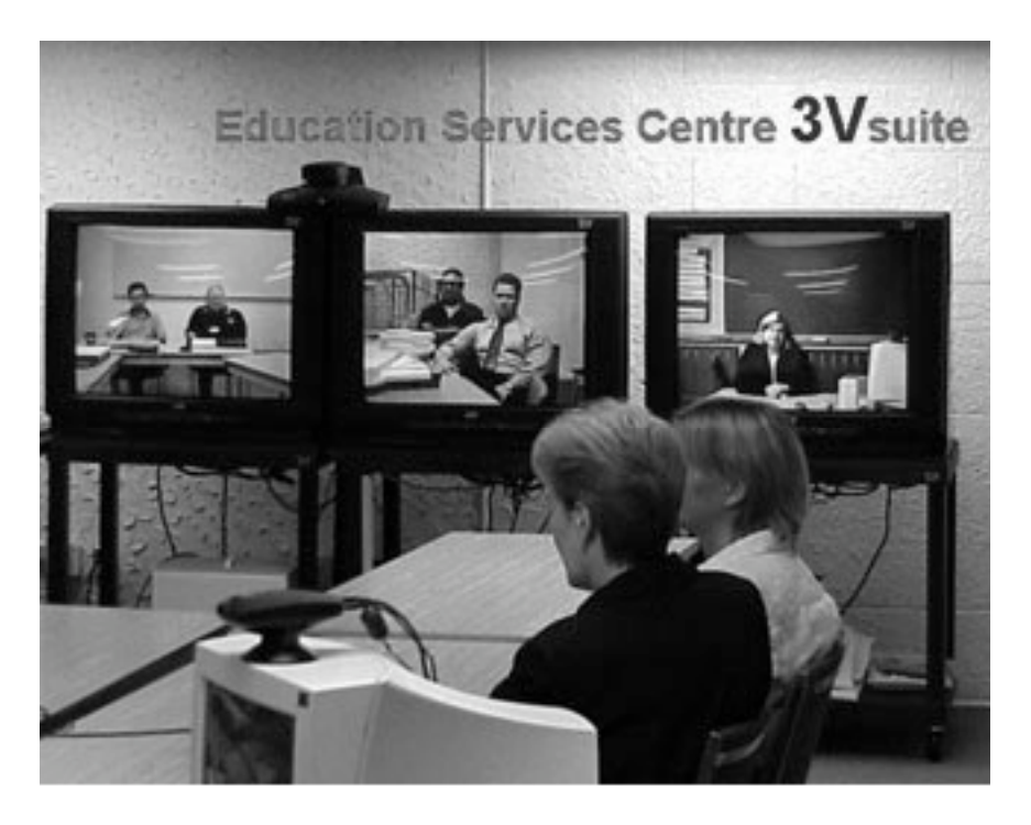
Figure 3. VC technology used for distributed staff meeting

supervision was assigned to a vice principal, librarian, or other adult at the remote school. The later option, while cost effective, placed increased duties and challenges on the delivery teacher, who often could not rely on continuous remote support. In most districts, a central administrator was assigned overall responsibility for the VC programming. In Alberta schools decision making, budgeting, and planning has largely devolved to the school level, therefore, programming that runs between multiple sites can create administrative challenges related to classroom and bus scheduling, bell ringing, announcements, holidays, teacher support, funding, and other local issues. Thus, the active central office participation in the design and operation of the VC programming is critical. Usually teachers were not given extra incentive to teach remotely and there was some sense that the teacher volunteers were given little choice but to participate in order to retain positions.