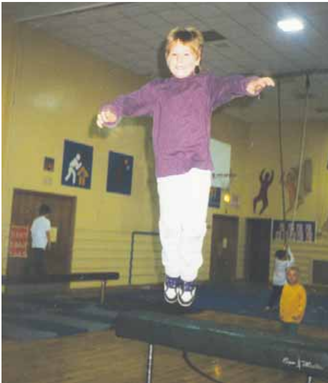
A first-grade student completes a modified vault. Motor skills need to be learned and practiced; they are not automatically acquired through maturation.

of these advancements in the infant's motor repertoire. In this sense, maturation would mean that these motor skills emerge regardless of the environment and without instruction or specific practice—as if these behaviors were “wired” into our bodies from the beginning of life. The problem with maturation as an explanation of motor skill development is that it is wrong.