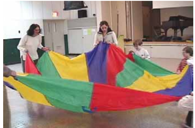
Negotiating an obstacle course of cartons (left) can help develop spatial awareness, while pulling a parachute up (above) and letting it fall back down can improve effort awareness.

sense of fluency and timing, thereby ameliorating their typical jerkiness and lack of finesse.